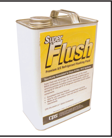
Store in a cool, well ventilated area

DISPOSAL: INSURE THAT USED PRODUCT AND CONTAINERS ARE PROPERLY DISPOSED OF IN ACCORDANCE WITH ALL LOCAL, STATE AND FEDERAL REGULATIONS.