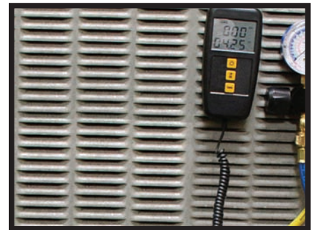
Magnet mount feature