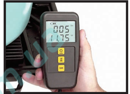
Ergonomic hand held remote